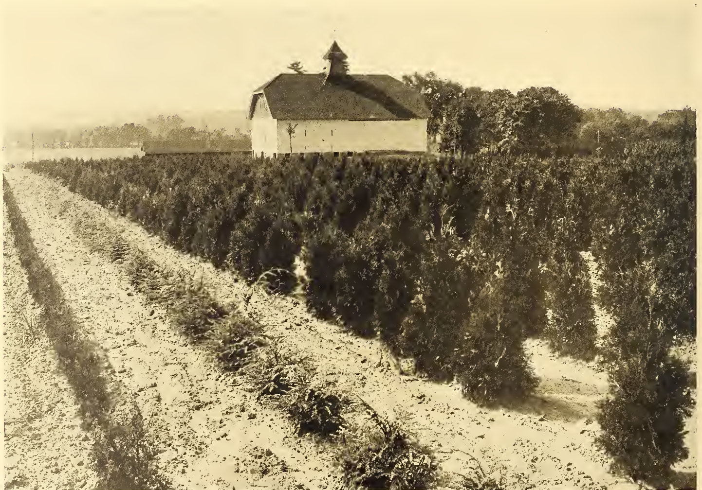
Our American Arbor Vitae: Shapely sheared specimens, and like all our Conifers, transplanted every other year.